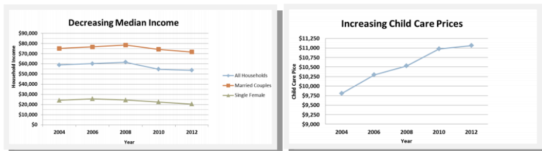
Source: Child Care and Education in Oregon and Its Counties: 2012 . Bobbie Weber, Oregon Child Care Research Partnership

In 2012, Oregon was rated the least-affordable state for center-based infant care. The average cost was greater than 18% of the state median income for married couples with children. A 2013 report from OSU found that the median cost of child care can cost nearly twice as much as college tuition at Oregon's public universities ($11,064/year for a toddler vs $6,670 annual college tuition). The same report found that child care costs for Oregon families increased 13% from 2004-12 while household incomes declined 9% (or 15% for single mothers).